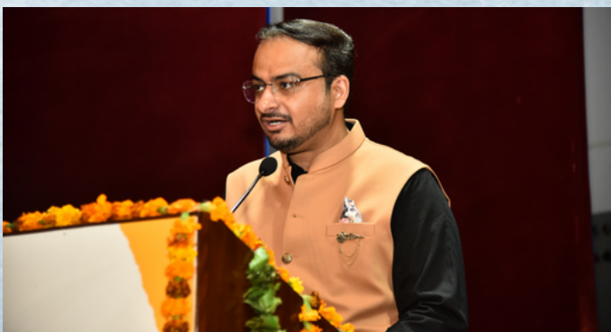
Opening remarks by Head of Dept.