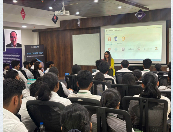
Industrial Visit to Grazitti Interactive, Panchkula