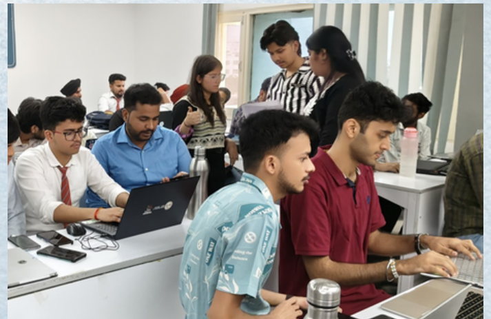
Participants working on their projects

To promote decentralized innovation and hands-on learning, the TechnoVerse Club at CGC-COE organized HackTheBlock 2025, a blockchain hackathon focused on building real-world solutions using Internet Computer Protocol (ICP).