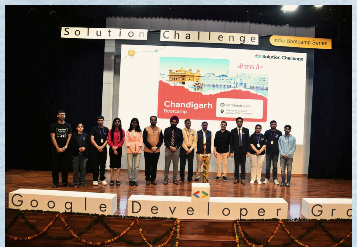
Felicitating our guests for their invaluable contributions.

“Let us be grateful to the people who make us better; they are the charming gardeners who make our souls blossom.” - Marcel Proust