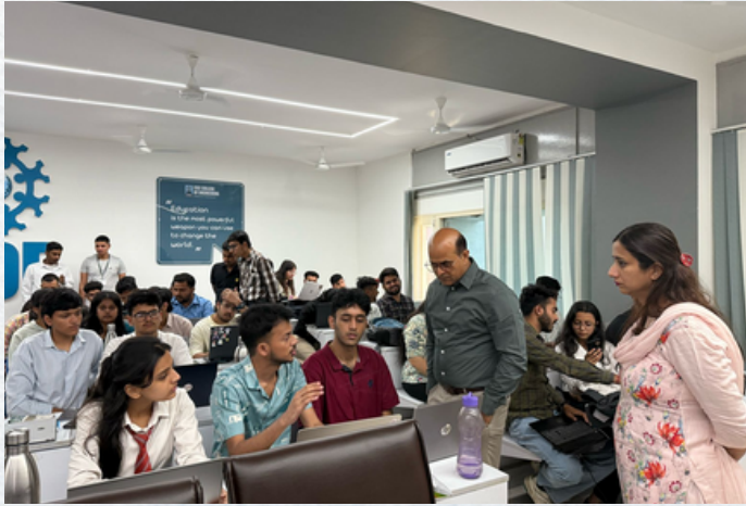
Participants showcasing their projects to the HOD

Organized by Technoverse Club, Dept. of CSE, CGC - COE | 26 March 2025