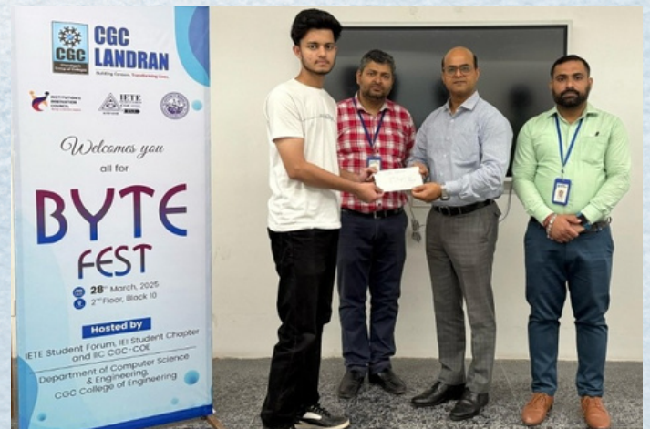
Prize Distribution Moment! BYTE FEST 2K25!