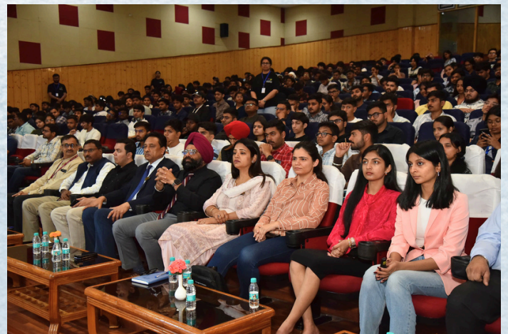
Guests, speakers and audience in the main auditorium