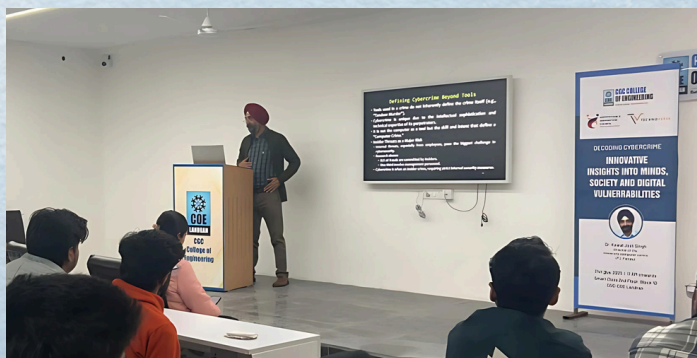
The speaker delivering the session

Follow us @ technoverse_club.coe and stay tuned for our next initiative