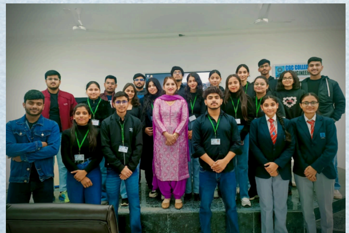
Organizing team after the successful wrap-up