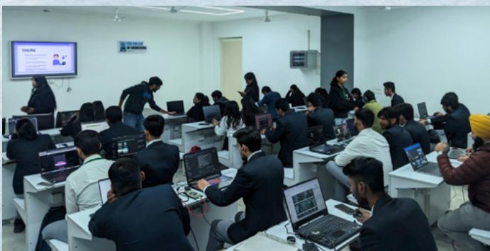
Hands on Workshop on the go