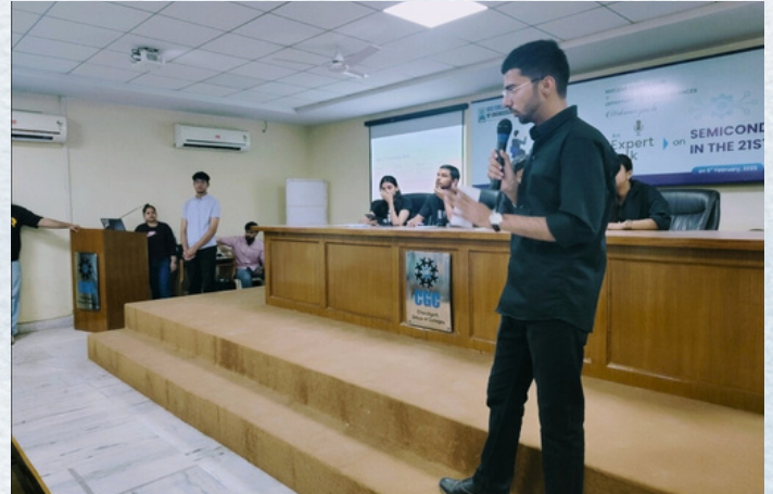
E-Cell President in Action - turning vision into execution.

To foster entrepreneurial thinking and real-world business learning, E-Cell CGC-COE hosted STARTUP MAFIA, a dynamic offline simulation event replicating the world of startups and investments.