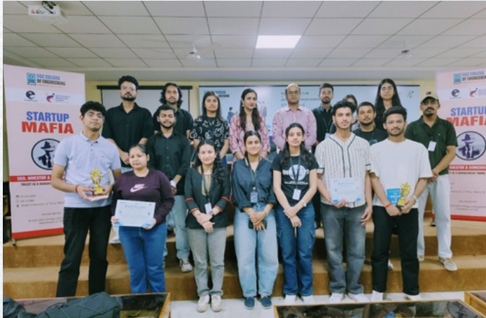
Winners with E Cell team, Faculty and HOD CSE

Organized by Entrepreneurship Cell, Dept. of CSE, CGC - COE | 4 April 2025