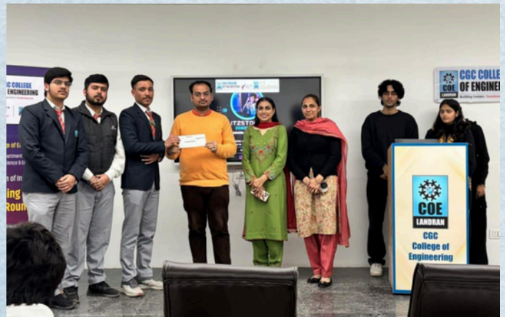
HOD sir giving prizes to the winners