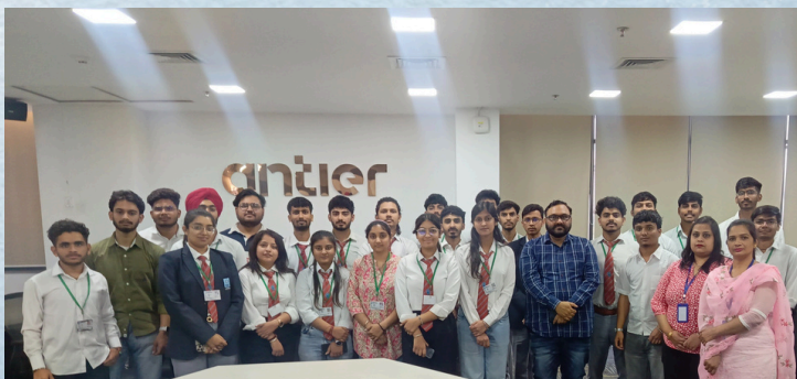
Industrial Visit to Antier Solutions, Mohali