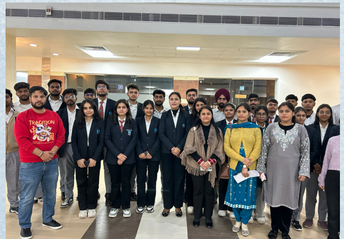
Industrial Visit to Meander Software, Mohali