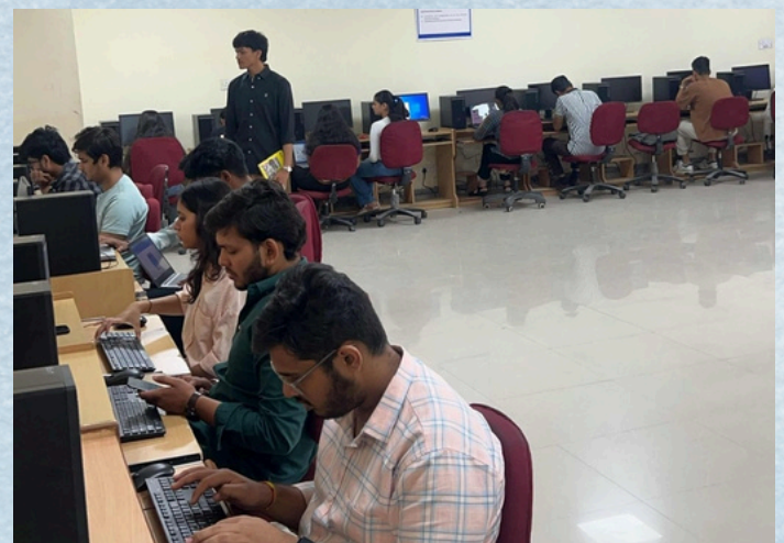
In the zone at BYTE FEST!

"BYTE FEST 2025 ignited innovation and excitement across campus, empowering students to think, code, and create." – IETE-SF & IEI-SC, CGC-COE