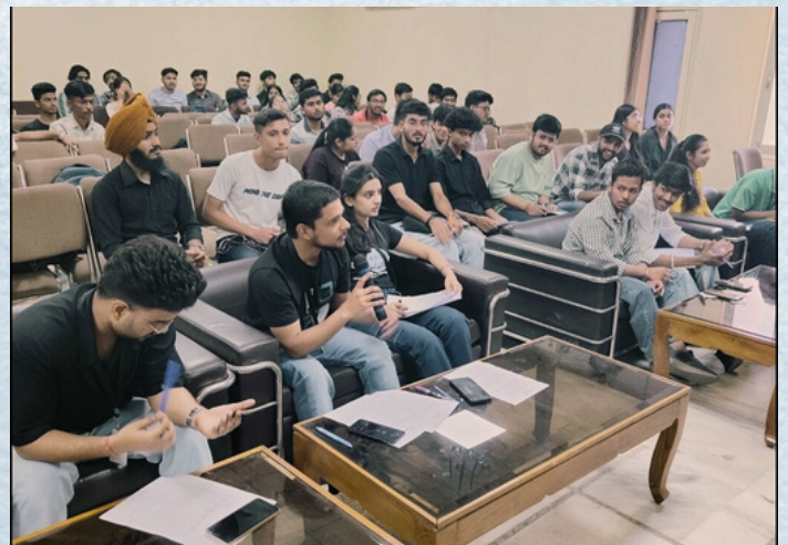
Investor Q&A in action!