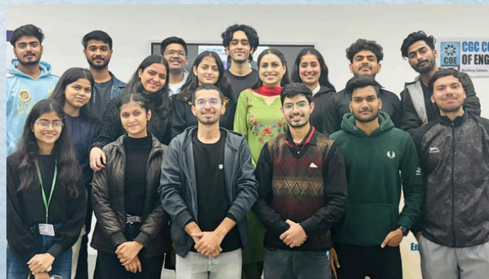
Organizing team after the successful wrap-up