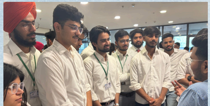
Industrial Visit to Alpha Technologies, Mohali